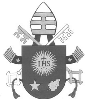
miserando atque eligendo